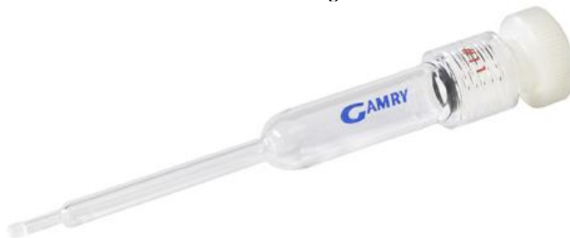
Figure 3 Reference Bridge Tube

Many experiments do not require a “true” reference electrode to be run. If a pseudo- or quasi-reference electrode is sufficient, you do not need to use the reference bridge tube.